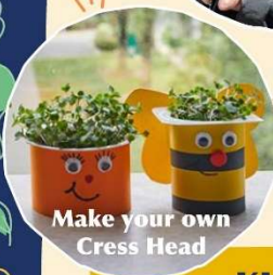
Make your own Cress Head